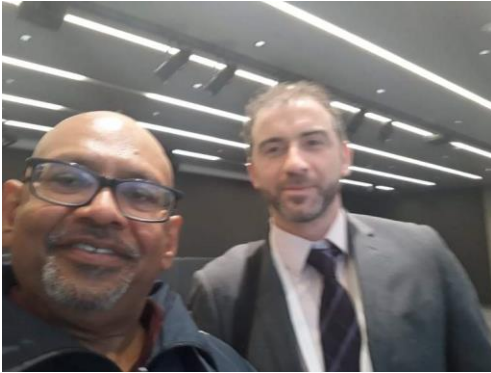
with Education Director