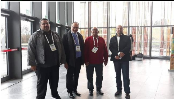
with Qatar Delegations